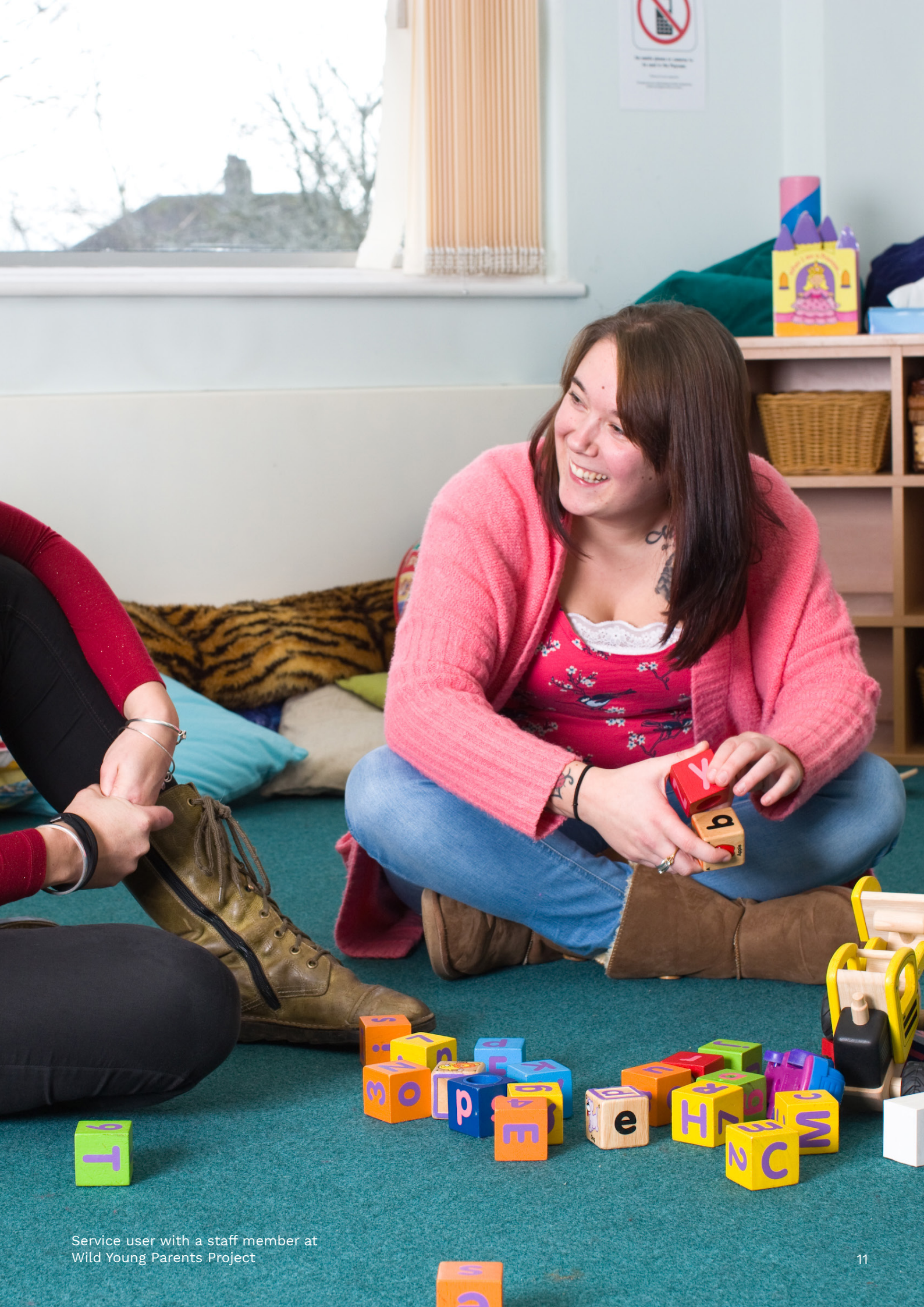
Service user with a staff member at Wild Young Parents Project